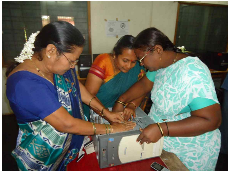
Teachers opening up a computer

Education should also support the learner to become a 'responsible citizen'. This means educational processes must enable the learner to question dominant perspectives and beliefs. Going against the grain may often be essential for positive progress in society. Hence, the use of AI needs to be appropriate to educational contexts and its direction designed in consultation with and participation of teachers and educators.